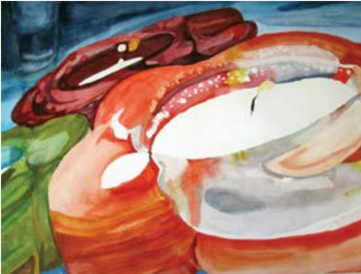
Candles