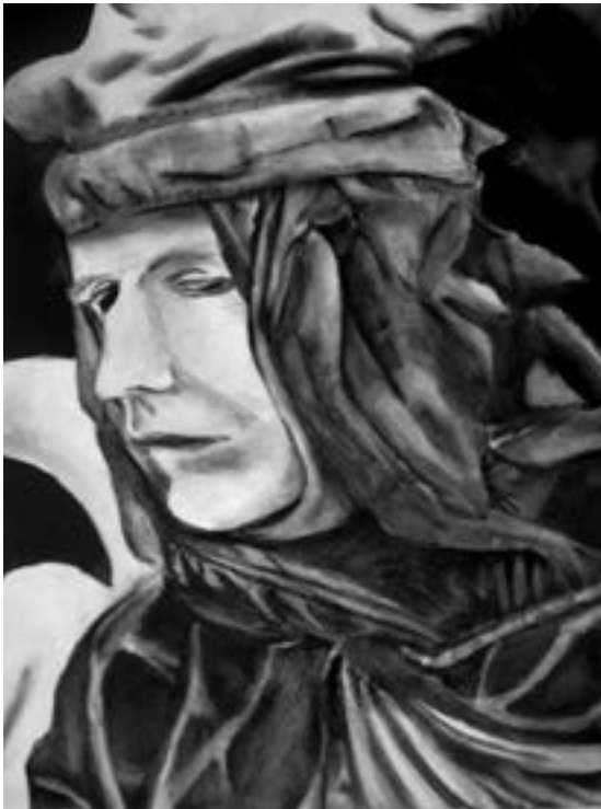
Italian Man ~ by Kerry Kirkpatrick

It eats what it wants, It breathes what it wants, It bleeds what it wants, For there is nothing real about a changeling. It steals personalities, It copies personalities, It kills personalities, For there is nothing unique about a changeling. It lives all alone, It fights all alone, It dies all alone, For no one ever loved a changeling.