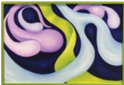
A River Runs Through - by Laura Ott