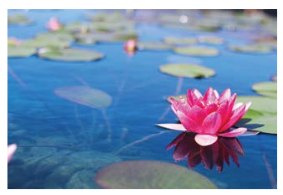
A Mirrored Reflection – by Aaron Iffland