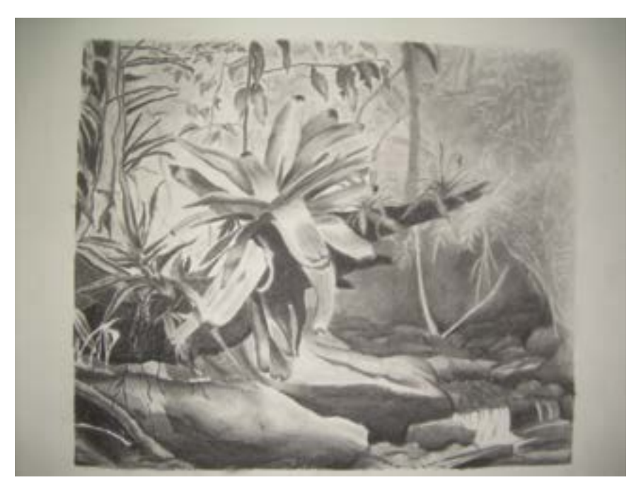
Untouched ~ by Adam Haley

We find ourselves beneath a dusty lilac moonrise, my hands pressing hair along the curve of your head. Semiotic light makes possible this dew, the geranium's blush, a rose's cameo unmasking, pollen and incense, cranberry and spiced plum. Supernatural philosophies expound in all that I hold, a fertile pod within which your sword-bearing angel reclines, inhibiting your mélange of passion, the copperized allure of intimacy ghosting along the edges of savory fronds.